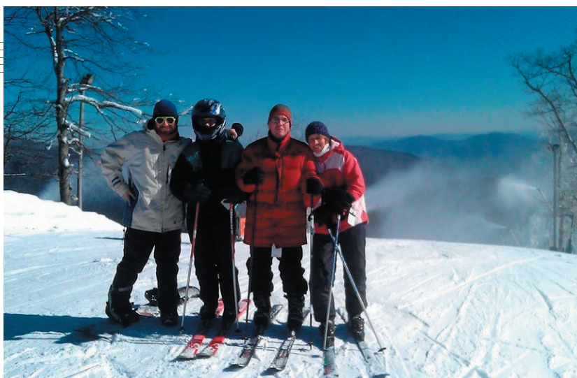
Special Olympics Skiing at Wintergreen