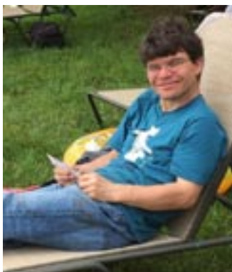
Tee and Heyward take it easy.