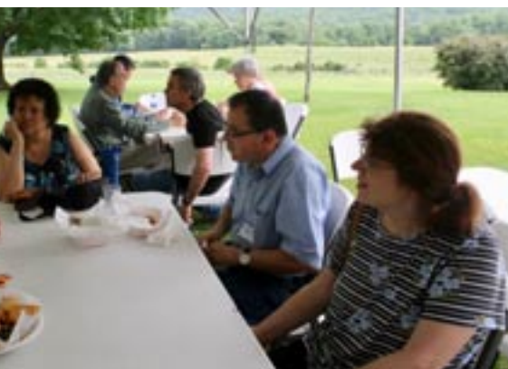
Laurel House enjoys food from Two Brothers Southwestern Grill.