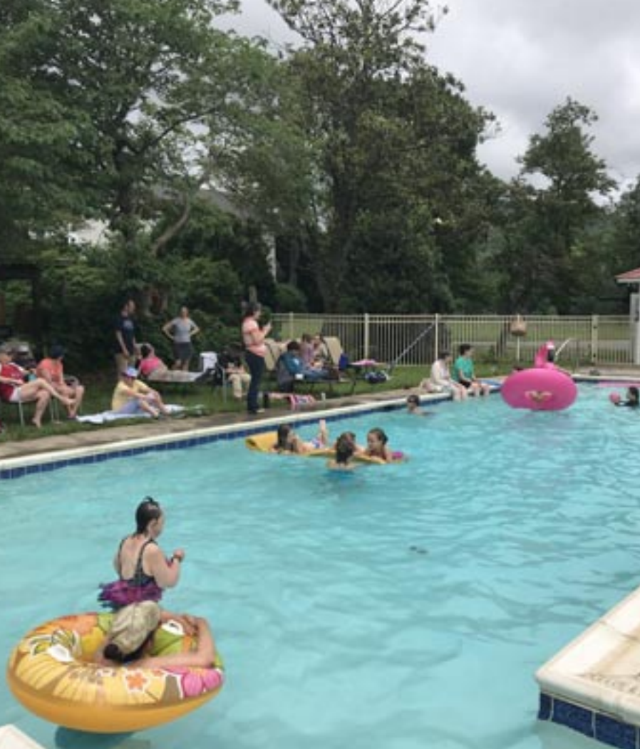
The start of the pool season is always favorite for so many!