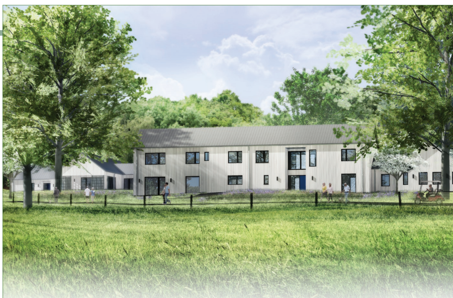
Kenmare and New Laurel