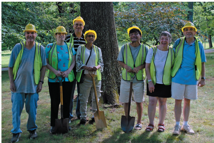
Laurel coworkers are shovel ready!