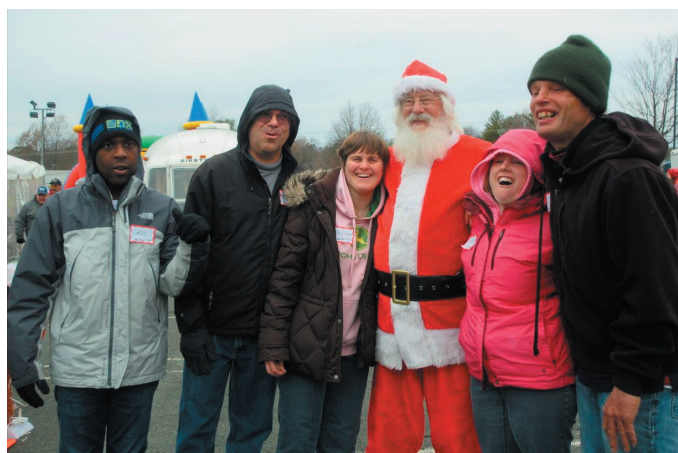
Santa and his Innisfree elves help out with the Toy Lift project.

The Jefferson Area Key Club helps us make blankets for Project Linus.