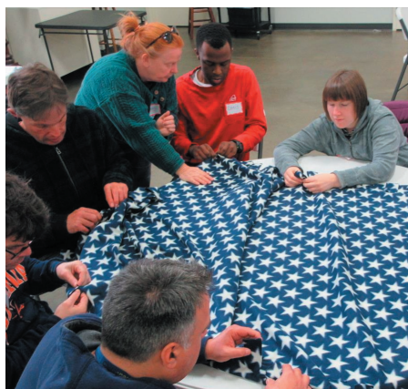
Our Aktion Club members finish a blanket at the weekly meeting.

T he Aktion Club is a chapter of Kiwanis, run by adults who are differently abled. The Jefferson Area Aktion Club started in August 2017 as a joint effort of Innisfree coworkers and participants in the Virginia Institute of Autism's Adult Academy, and is supported by our local Kiwanis Club. We wanted to share a few of the many ways our Kiwanians have given back to the community.