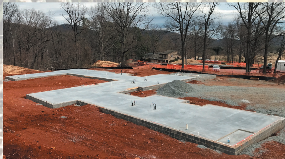
Kenmare is well underway with its finished slab foundation.

We do our very best to keep our records accurate and we want to acknowledge your gifts. If we have made an error, please contact us so we may correct this listing.