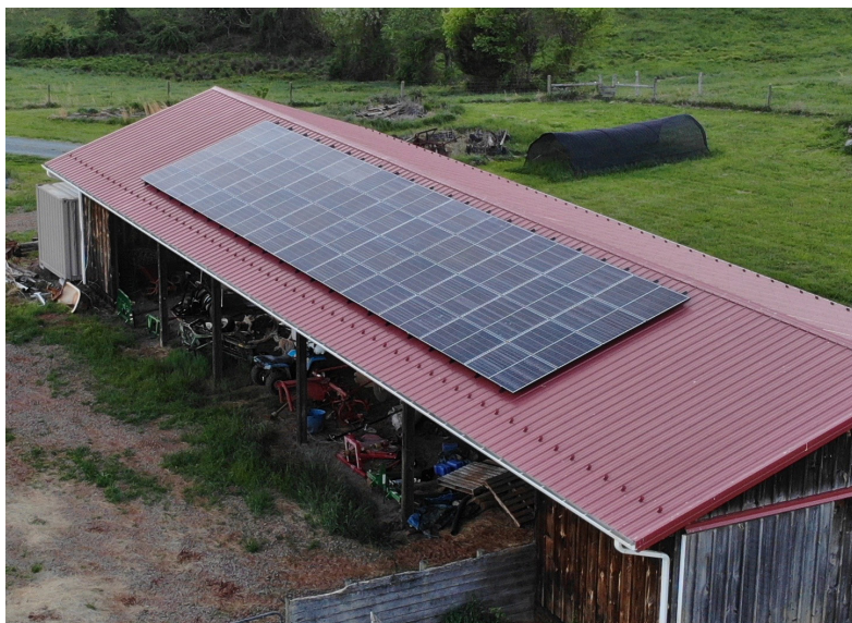
The equipment barn shows off its new makeover with a birds eye view.

be using light magic and saving money on our electric bills all at the same time. It is definitely a win-win situation. Good magic for sure made possible by the generous support of the Solar Moonshot Program of the Left Coast Fund and a local anonymous donor. We are very grateful!