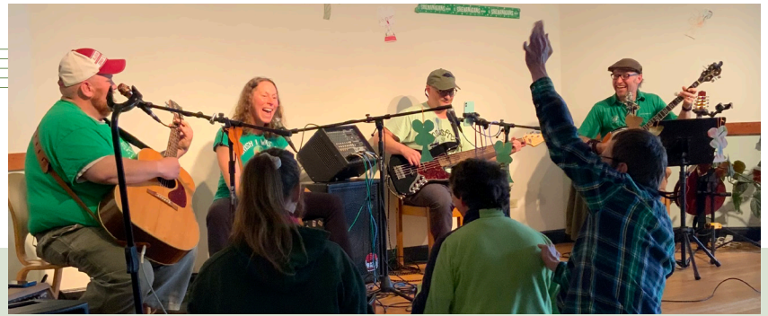
Grainneog sings to some of their most dedicated fans.