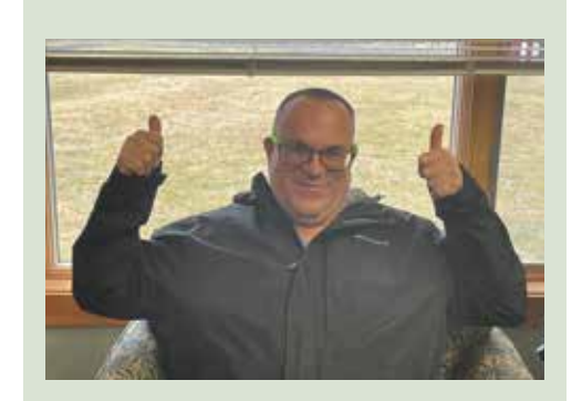
Jokes with the "Master Jokester"

Favorite thing about Innisfree so far: Being surrounded by people of different backgrounds. I have become more understanding, open minded and appreciative. Laughing, talking and dancing bring/give me peace of mind, so being at Innisfree, I feel at home, there are lots of happy faces, laughter and dancers of course. So, as a farmer girl from Lesotho, I am happy to be here because I will be able to work with the soil and get my hands dirty.