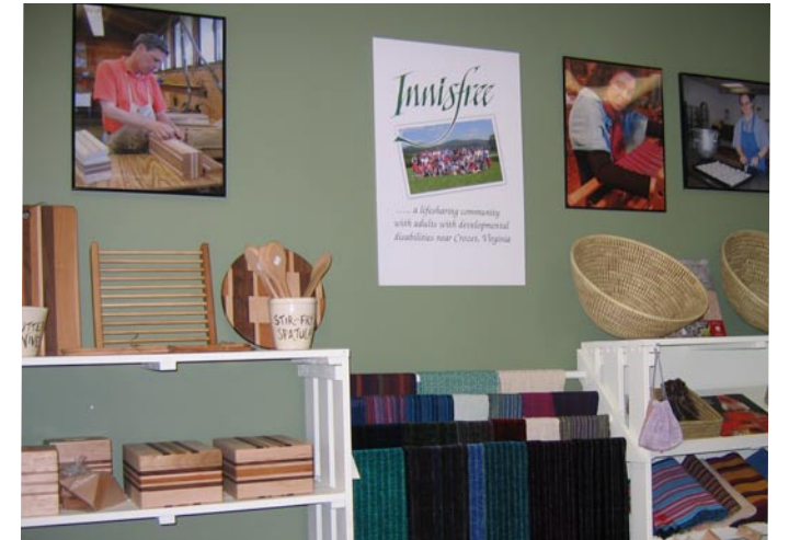
Our weaving and woodworking products have a prime space in the new store.

husband Butch, in disassembling and re-assembling the computer and cash register system. We enhanced the display of Innisfree products with wonderful close ups of our coworker artisans and increased our stock of very special pottery. We brought a weavery loom onto the floor space as a way to show off our