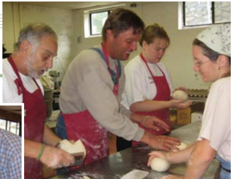
Bakers forming loaves together.