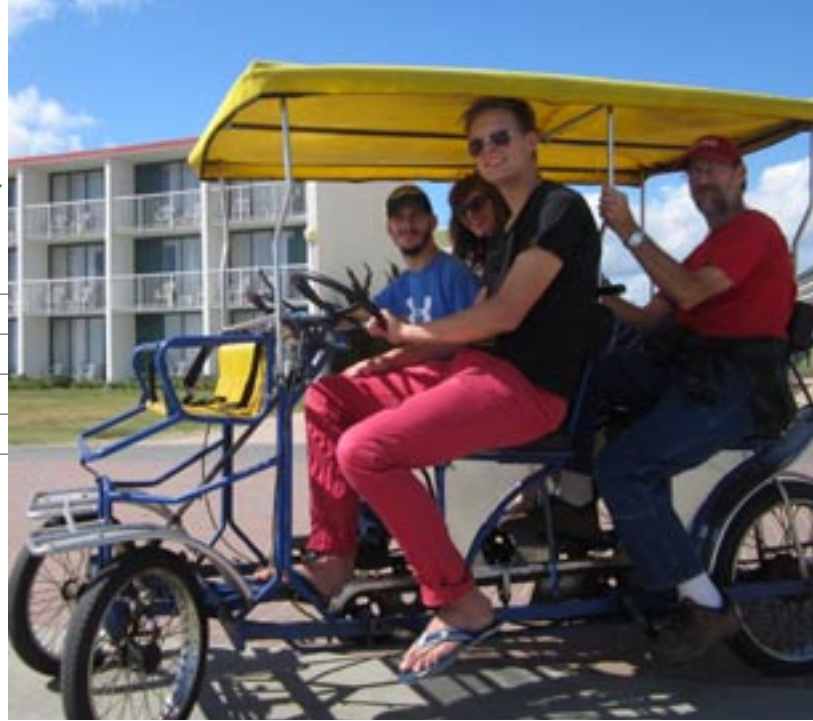
The Harmony Group explores Virginia Beach.