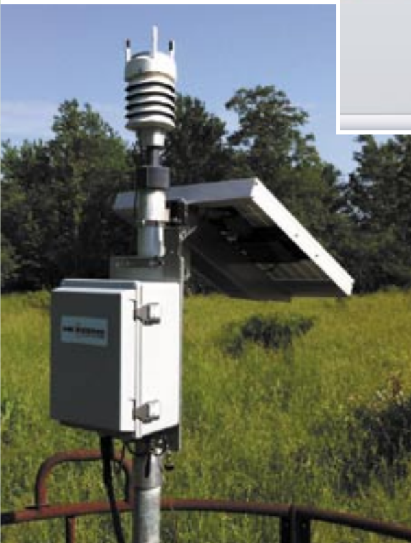
Multi-sensor weather station and water quality data-logger.