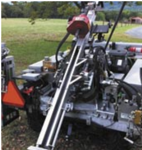
Photos taken by coworkers to create time-lapse views.