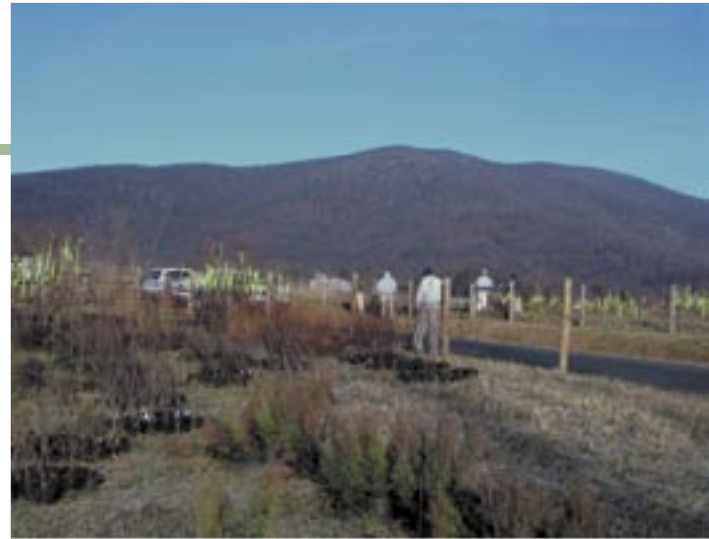
7400 trees have been planted.